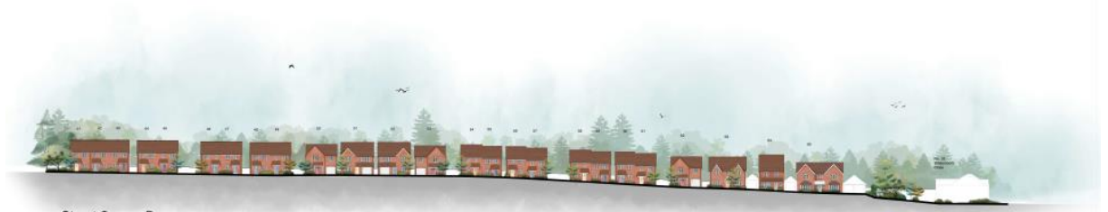
Street Scene -B