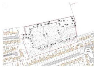
Street Scene Locations