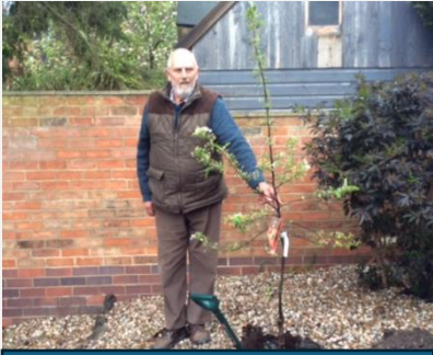
Hinckley Bowls Club