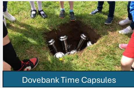
Dovebank Time Capsules