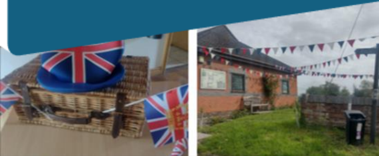
Coronation Grant Funding