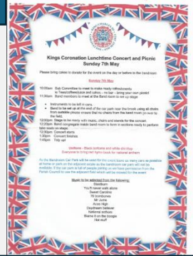
Ratby Cooperative Band