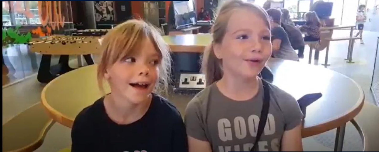
Emmaus Community Defibrillator