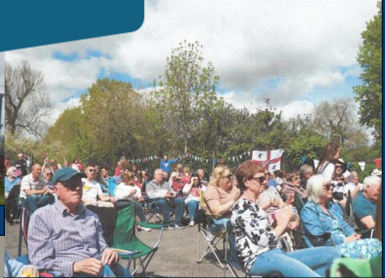
Ratby Cooperative Band